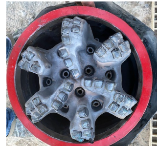
Bit #1 1,851' - 8,815'