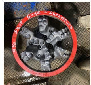
Bit #2 8,815' - 10,508'