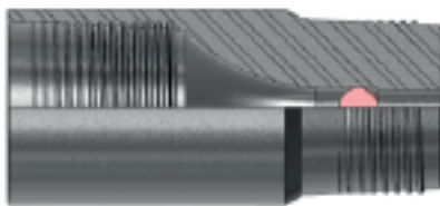
FracRight Ball Catcher Sub Sleeve

TAQA's Check-Valve Guide Shoe is designed specifically for circulation of fluids whilst running in hole. The intergrated spring loaded check valve allows fluid circulation from the tubing to annulus without U-tubing returns. The Shoe is able to withstand high temperatures and large volumes of fluid.